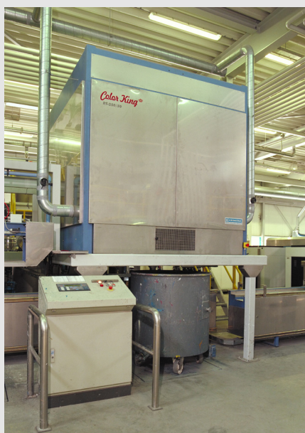
Elevated set-up batch dispensing.