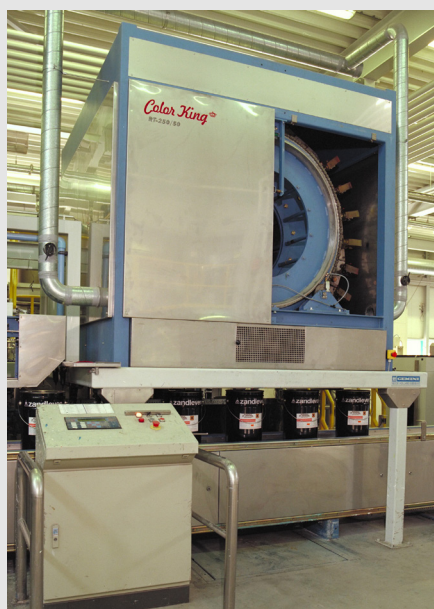
Elevated set-up in-can tinting.