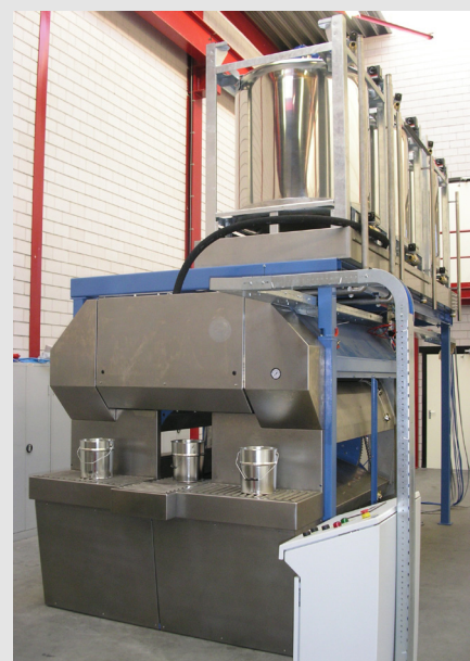
Non-elevated set-up for in-can tinting only.